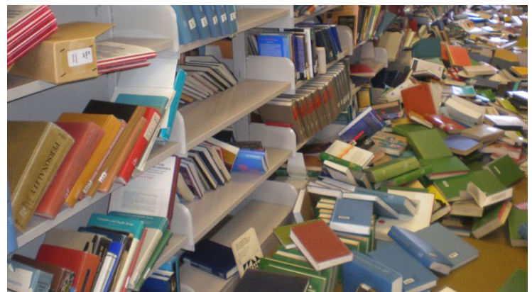
Figure 1 Books Shaken from Shelves at the University of Canterbury Library