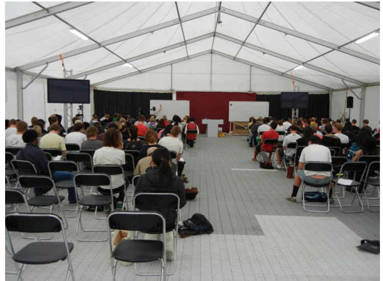
Figure 3 Temporary Classrooms at the University of Canterbury