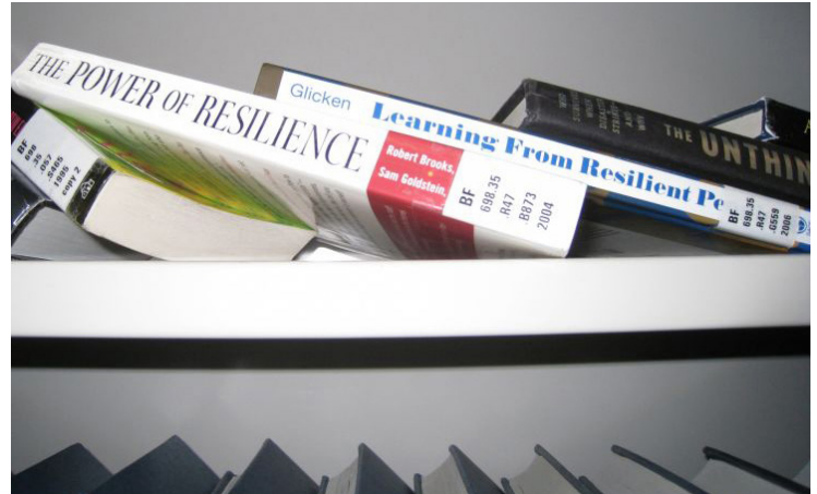
Figure 2 Resilience Books at the University of Canterbury Library