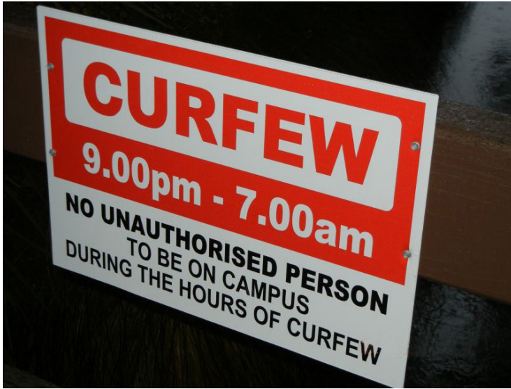
Figure 4 University of Canterbury Curfew